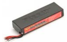
#704 Reedy LiPo 5000 w/connector (2)