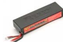
#703 Reedy LiPo 5000 PRO (2)